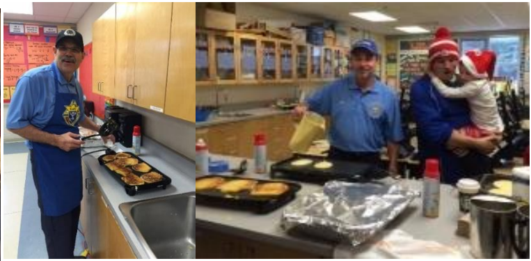
Breakfast with Santa